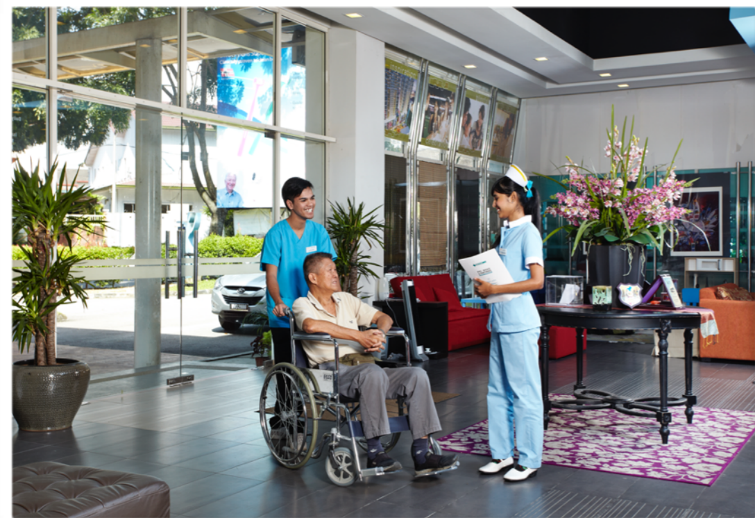
Smile Link Dental Group HQ at Sri Petaling